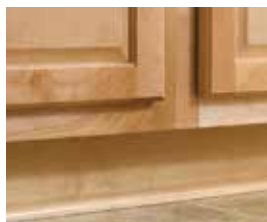
Add matching toe kick and quarter round to base cabinets.

Our accessories program makes it easy, and economical, to design the kitchen you want. Kitchen Kompact offers a full range of accessories — high-end attractions that give any kitchen a custom look, right out of stock.