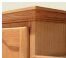
Crown molding, trim and valences offer a stylish touch.