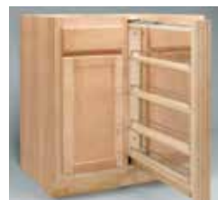
A roll-out filler makes great use of space between base cabinets.