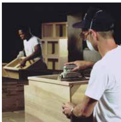
Our employees are craftsmen with a personal commitment to the quality of our cabinets.

On average, each of our 250 employees at KK produces four times the industry norm for cabinets, every single shift. We maintain that incredible productivity through an ingenious plant-wide incentive plan developed by Dwight Gahm himself. And because that efficiency means more precise cost controls, our customers benefit through lower and more stable prices.