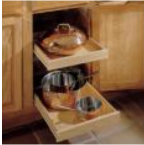
Base Roll Out Trays