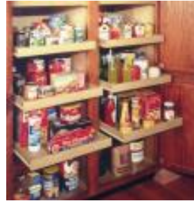
Pantry Roll Out Trays