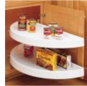
Half Moon Shelf